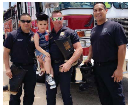
Houston Local 341

Thank you again to all the local in the TSAFF for your continued support and hard work in 2017. We are excited to grow our partnership and make a bigger difference in 2018.